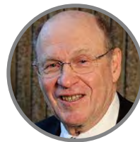
Nahum Sonenberg, OC PhD FRS FRSC Montréal, Quebec